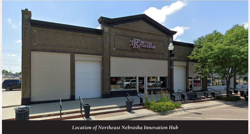
Location of Northeast Nebraska Innovation Hub