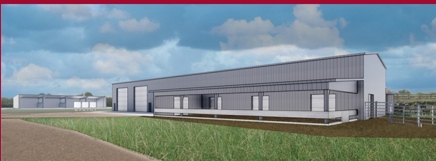
Feedlot Operations Building