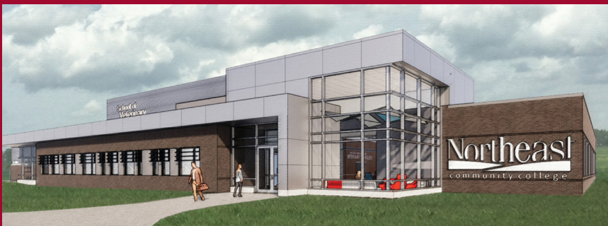
Veterinary Technology Building