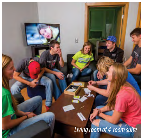
Living room of 4-room suite