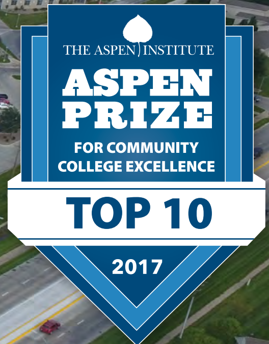
Aerial photo of Northeast Community College in Norfolk, Nebraska taken September 2016.