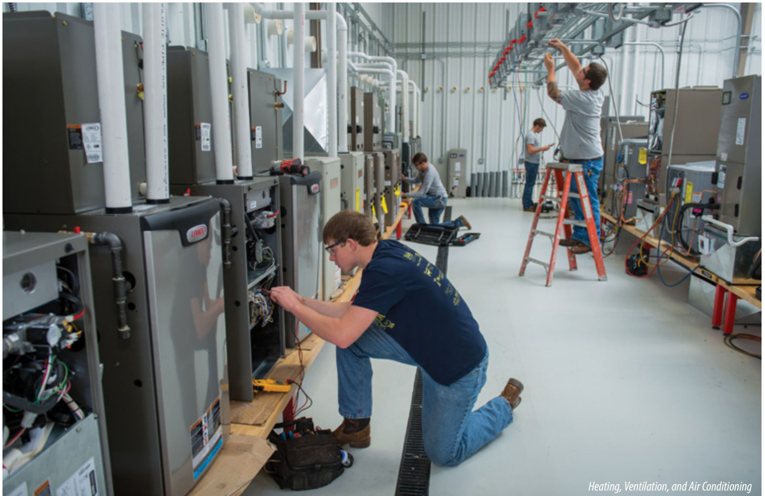
Heating, Ventilation, and Air Conditioning