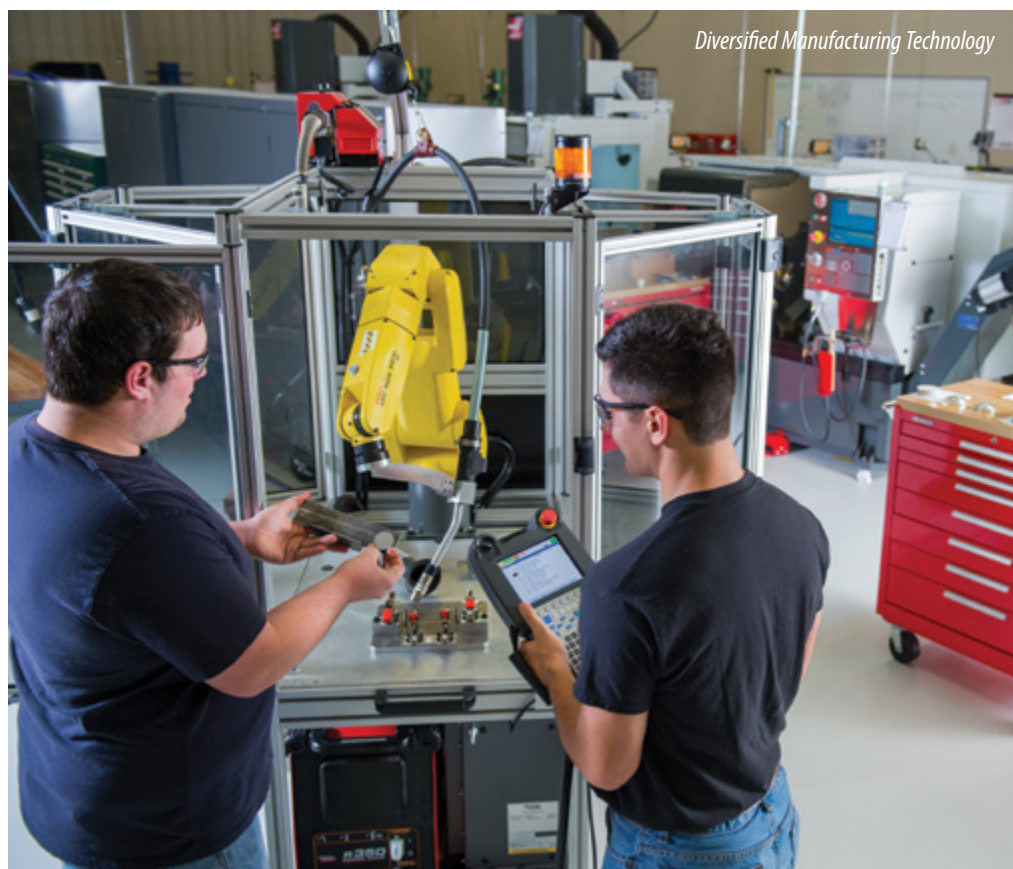
Diversified Manufacturing Technology

"This place is going to provide the skilled labor force that will meet the needs of many, many businesses. It is definitely going to attract future generations of students. I see not only the potential of how it will serve North Central Nebraska and southern South Dakota, but the building and its faculty are great recruitment tools. When I do graduate and do become part of that alum, I will be proud to be able to tell people that I gained that experience here at Northeast." ■