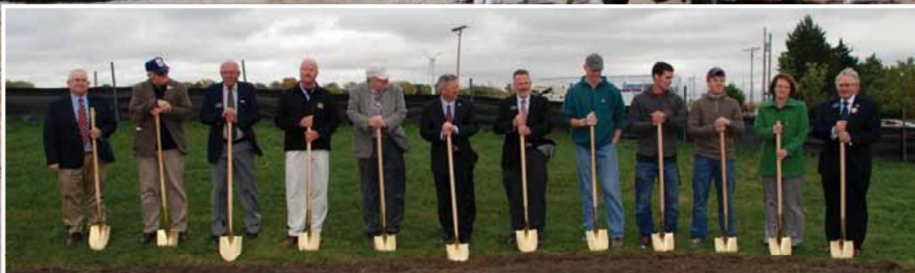
The Groundbreaking ceremony for the Applied Technology Building was held in October of 2013. Construction began shortly after and is expected to be completed at the beginning of 2015.

The 66,613 square foot facility under construction at the north end of the Norfolk campus will house the Heating, Ventilation and Air Conditioning (HVAC), Building Construction, Electromechanical,