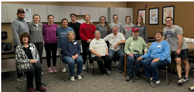
The Class of 2024 met some Norfolk residents who have been impacted by Parkinson's Disease.

From 2000 to 2020, an average of 518 individuals in Nebraska were diagnosed with PD each year (dhhs.ne.gov), yet only nine PTAs within a 90-mile radius of Norfolk currently hold an LSVT BIG certification (lsvtglobal.com). Nationally, the Parkinson's Foundation reports that over 90,000 people are diagnosed with PD each year in the U.S., with projections estimating that 1.2 million Americans will be living with PD by 2030 (parkinson.org). In response to these figures and a recommendation from the PTA Program Advisory Committee, the program recognized the value of offering this certification to better equip graduates to serve our region.