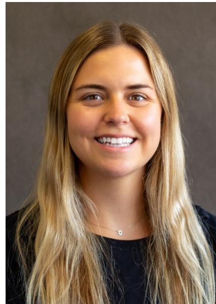
Northeast Community College Physical Therapist Assistant Newsletter