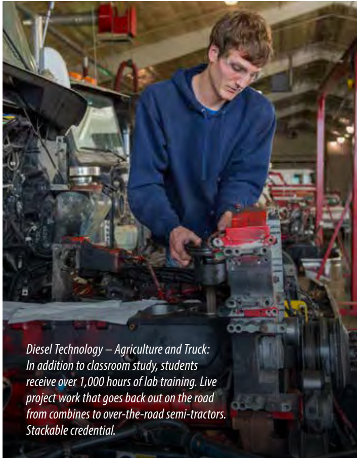
Diesel Technology – Agriculture and Truck: In addition to classroom study, students receive over 1,000 hours of lab training. Live project work that goes back out on the road from combines to over-the-road semi-tractors. Stackable credential.