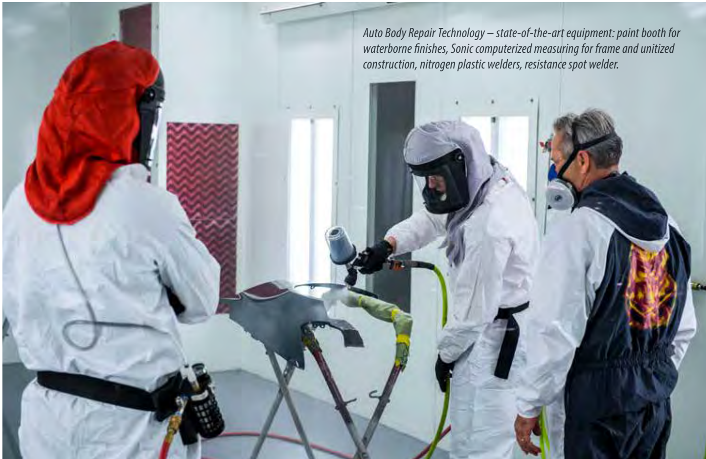
Auto Body Repair Technology – state-of-the-art equipment: paint booth for waterborne finishes, Sonic computerized measuring for frame and unitized construction, nitrogen plastic welders, resistance spot welder.