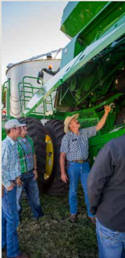
Northeast combines quality, convenience, and cost so you have more control over your education and your future.