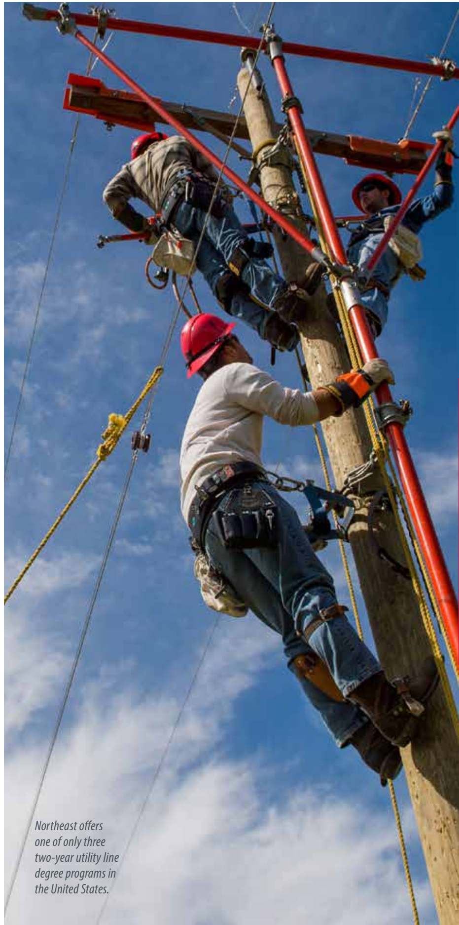
Northeast offers one of only three two-year utility line degree programs in the United States.

Northeast not only contributes to the workforce through its skilled graduates and training programs, its regional economic impact is substantial to the northeast region of Nebraska.