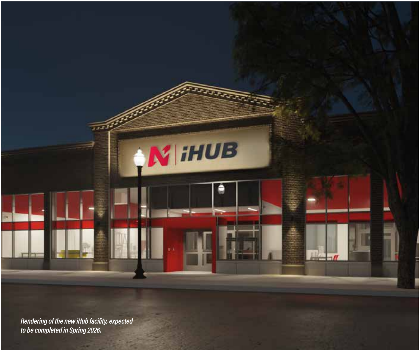
Rendering of the new iHub facility, expected to be completed in Spring 2026.