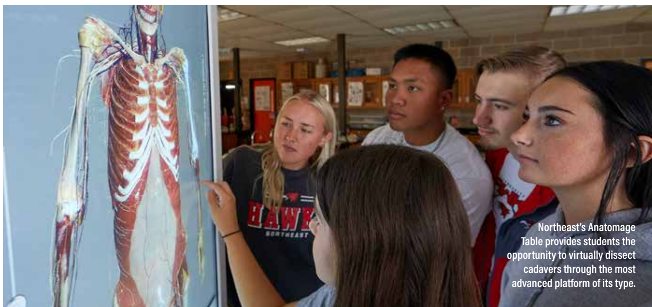
Northeast's Anatomage Table provides students the opportunity to virtually dissect cadavers through the most advanced platform of its type.

When it comes to education, we believe that students shouldn't have to compromise quality for convenience or cost.