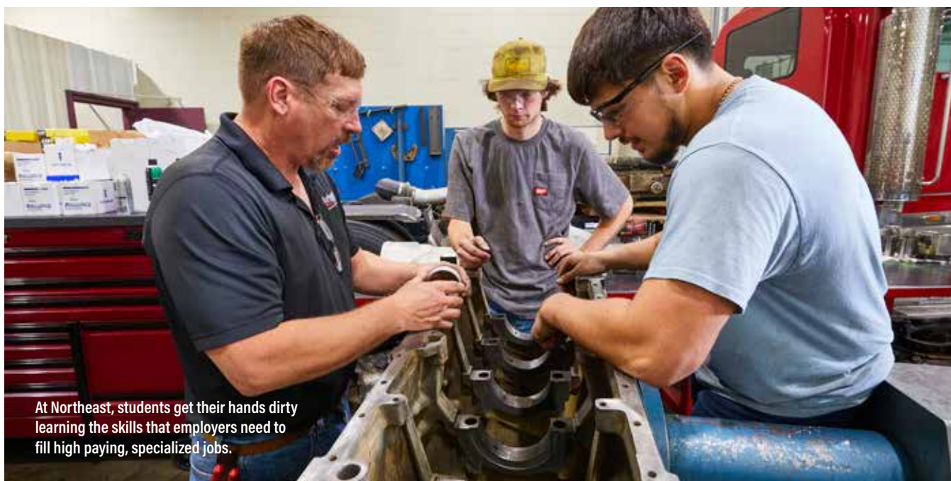
At Northeast, students get their hands dirty learning the skills that employers need to fill high paying, specialized jobs.