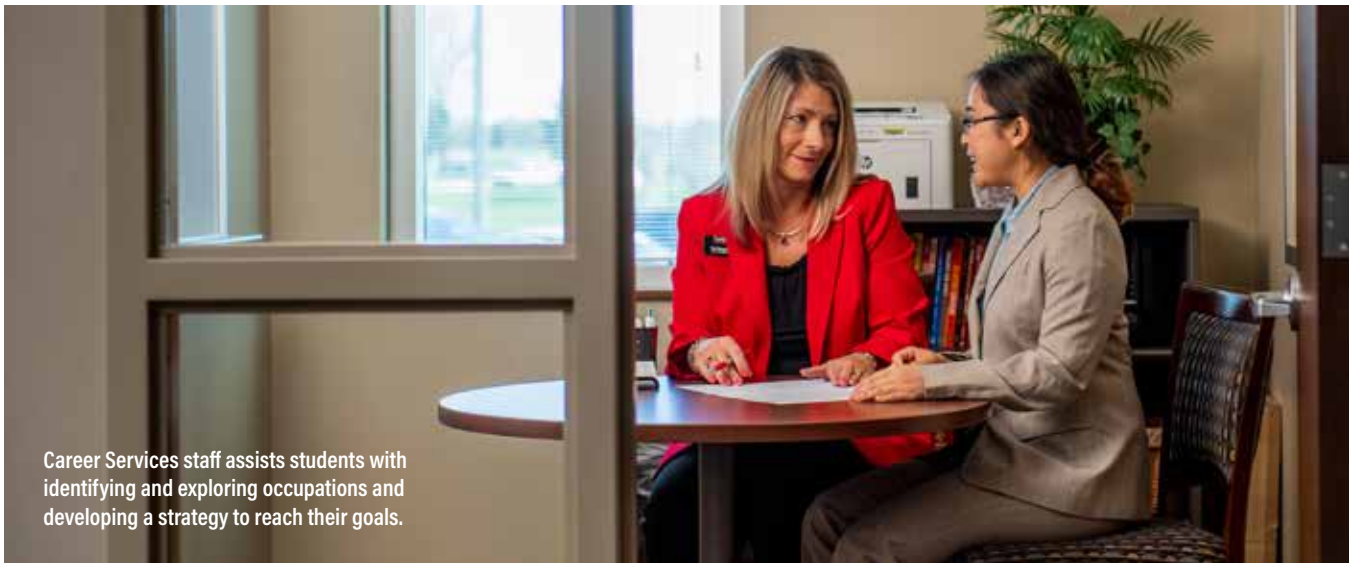
Career Services staff assists students with identifying and exploring occupations and developing a strategy to reach their goals.